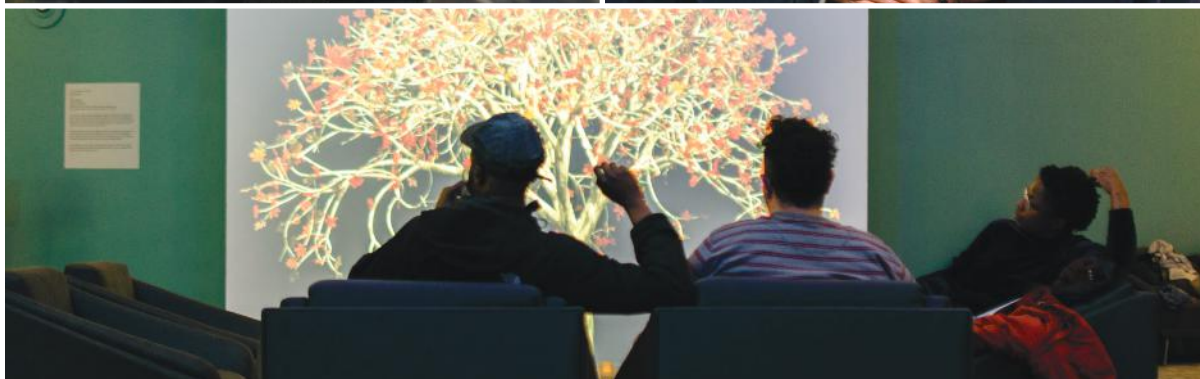
Member after-parties for Jazz at Lincoln Center Orchestra with Wynton Marsalis and Malpaso Dance.