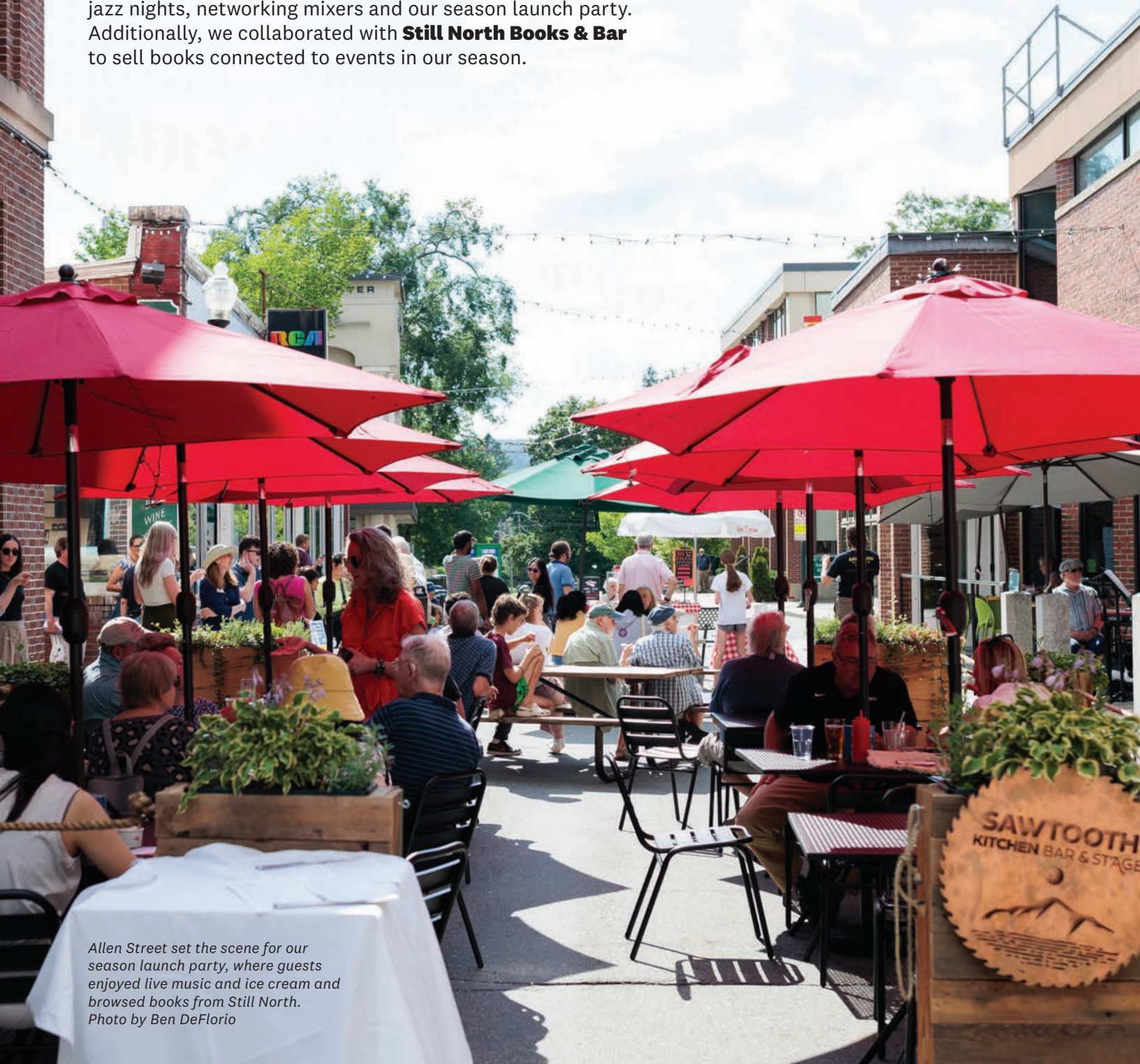
Allen Street set the scene for our season launch party, where guests enjoyed live music and ice cream and browsed books from Still North.

We joined forces with Sawtooth Kitchen , bringing a diverse range of events, including a three-day student art festival, soulful jazz nights, networking mixers and our season launch party. Additionally, we collaborated with Still North Books & Bar to sell books connected to events in our season.