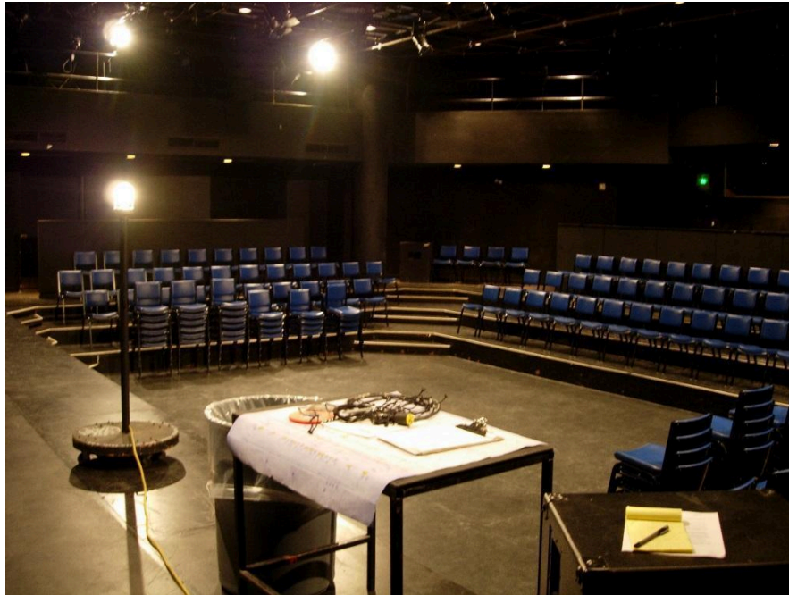
Bentley Theater Pit Area/Audience