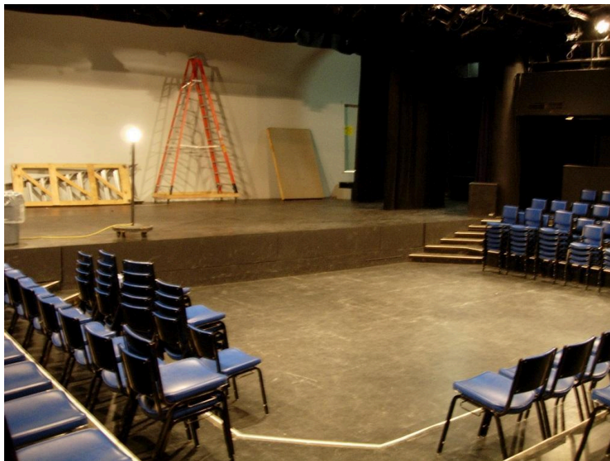
Bentley Theater Stage above Pit Area