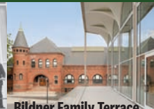
Bildner Family Terrace