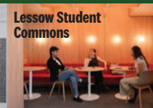
Lessow Student Commons

Today, with new and upgraded spaces, the reimagined Hop continues its commitment to experimentation and to the creation of ever-more ambitious art forms and models by students, faculty and professional artists. The expansion and redesign embrace the continued blurring of boundaries between artistic and other disciplines, as well as the growing incorporation of new technologies.