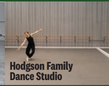
Hodgson Family Dance Studio