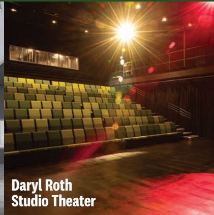
Daryl Roth Studio Theater