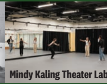
Mindy Kaling Theater Lab