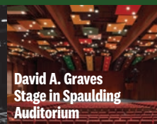
David A. Graves Stage in Spaulding Auditorium