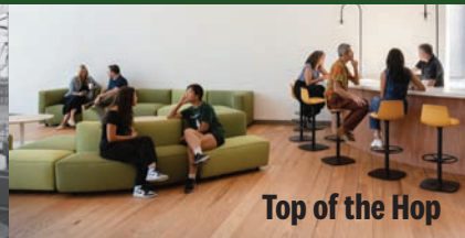
Top of the Hop